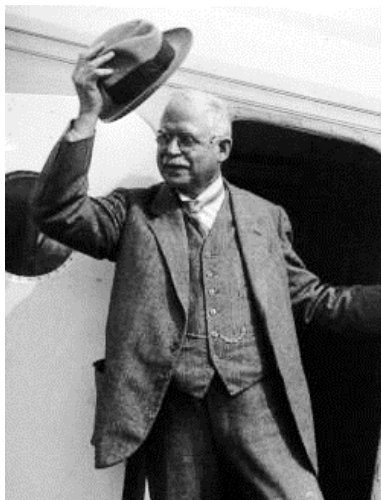
5. Strickland during the election campaign of 1932. (Aged 71)