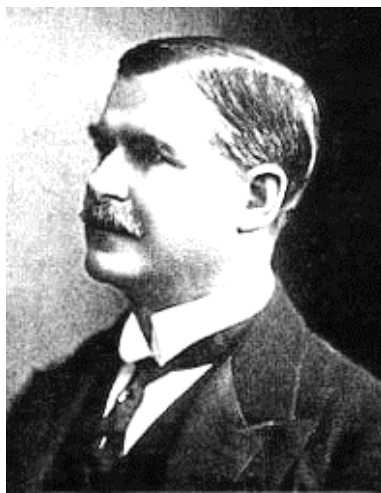
2. Strickland in 1902 when he was appointed Governor of Leeward Islands. (Aged 43)