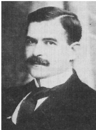
1. Strickland in 1889 when he was appointed Chief Secretary to the Imperial Government. (Aged 28)