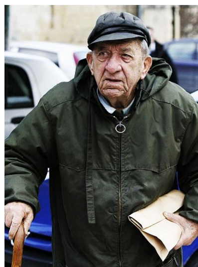
6. Dom Mintoff when he retired from active politics in 1998 (aged 82)

for Year 10 History (Option)