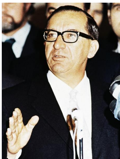
4. Dom Mintoff as Leader of the Opposition in the 1960s (aged around 50)