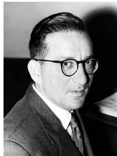
3. Dom Mintoff as Prime Minister for the first time in (1955-1958) (aged 38-41)