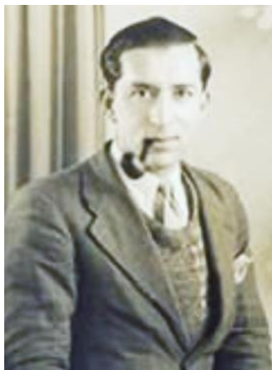
2. Dom Mintoff as General Secretary of the Labour Party (1935-1945)