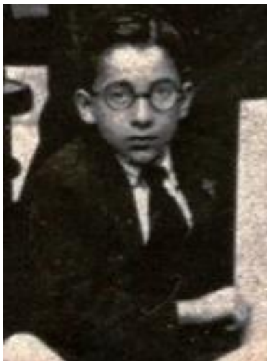
1. Mintoff as a student at the Seminary in 1928 (aged 12)

Born: 6 August 1916 - Died: 20 August 2012 (Aged 96)