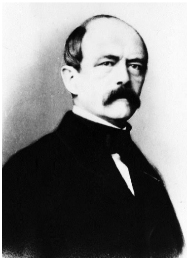
Bismarck in 1862 as Minister-President of Prussia (aged 47)