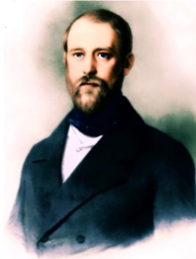
Bismarck in 1848 as a member in the Frankfurt Parliament (aged 33)