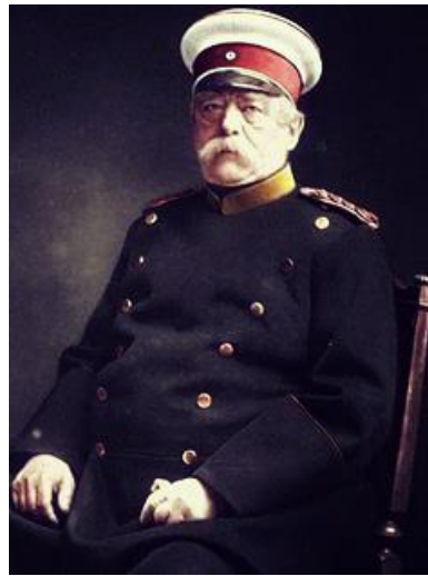
Bismarck in 1875 as Chancellor of the German Empire (aged 60)