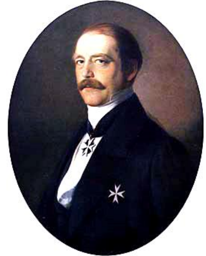
Bismarck in 1858 as Prussian Ambassador in St Petersburg, Russia (aged 43)