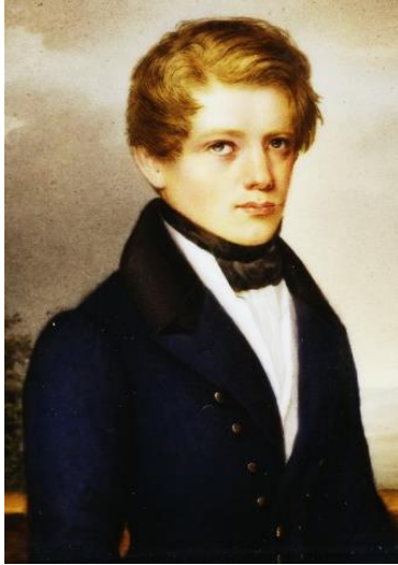
Bismarck as a young man in 1836 (aged 21)

Born: 1 April 1815 Died: 30 July 1898 (Aged 83)