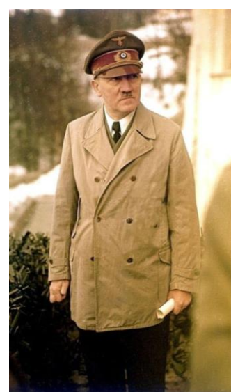
6. Hitler in 1945 close to Germany's defeat in World War II.

© History Department, Curriculum Centre Annexe, 2021 for Year 10 History (Option)