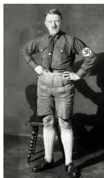
3. Hitler wearing the SA uniform in 1924.