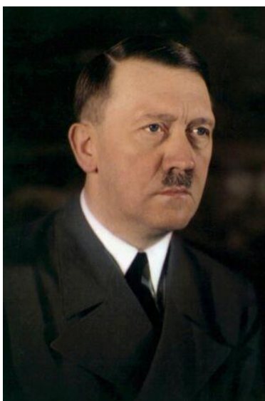
4. Hitler when appointed Chancellor in 1933.