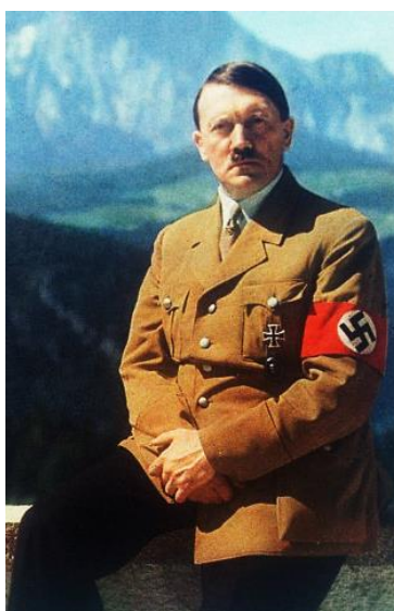
5. Hitler as Führer at the Berghof in the Bavarian Alps.