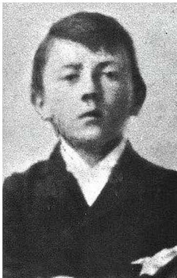
1. Hitler's childhood years at Braunau am Inn (Austria).

Born: 20 Apr. 1889 Died: 30 Apr. 1945 (Aged 56)