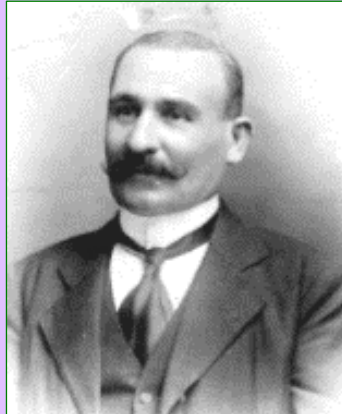
2. Dimech as founder of the Fellowship of the Enlighthened in 1898 (aged 37)