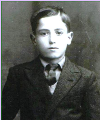
1. Photograph of Manwel Dimech in 1870 (aged 9)

Trade unionist and founder of the G.W.U. Born: 15 November 1898 - Died: 21 July 1970 (Aged 72)