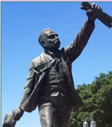
4. Monument of Manwel Dimech at Castille Square, Valletta, inaugurated in 1976