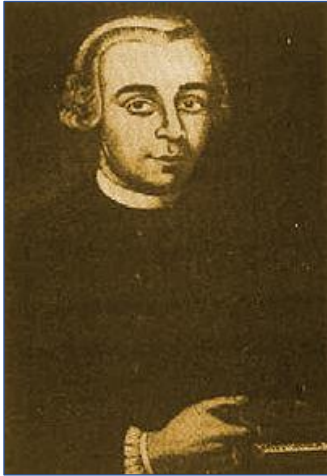
1. A contemporary portrait of Dun Mikiel Xerri

Born: 5 March 1764 Died: 12 January 1829 (Aged 65)