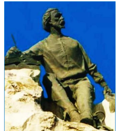
6. Monument dedicated to the memory of Vassalli at Ħaż-Żebbuġ, his hometown

© History Department, Curriculum Centre Annexe, 2021 for Year 9 History (Option)