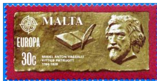
5. Image of Vassalli as commemorated on a Maltese stamp