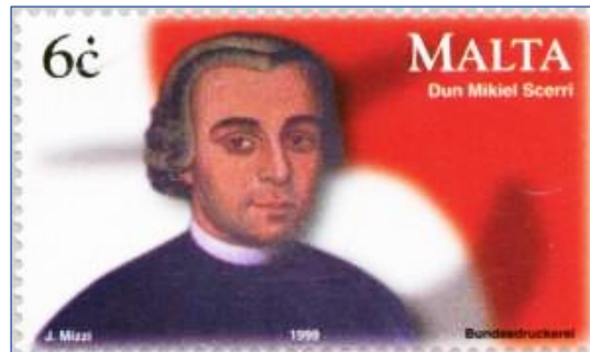
2. Portrait of Dun Mikiel Xerri commemorated on a Maltese stamp of 1999.