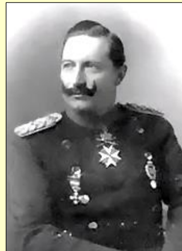
3. Kaiser William wearing the Prussian officers' uniform in 1890. (aged 31)