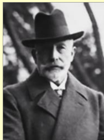
6. William II in exile at Doorn, the Netherlands. Photographed in 1931 (aged 72)

© History Department, Curriculum Centre Annexe, 2021 for Year 10 History (Option)