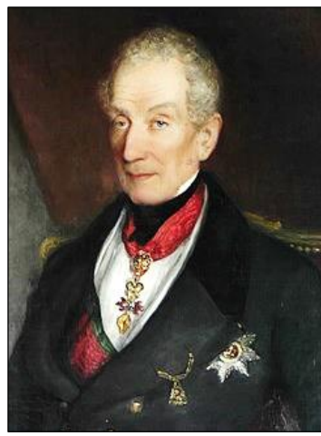
5. Metternich at the apex of his power as Chancellor in 1835 Königswart Castle, Bohemia (aged 62)