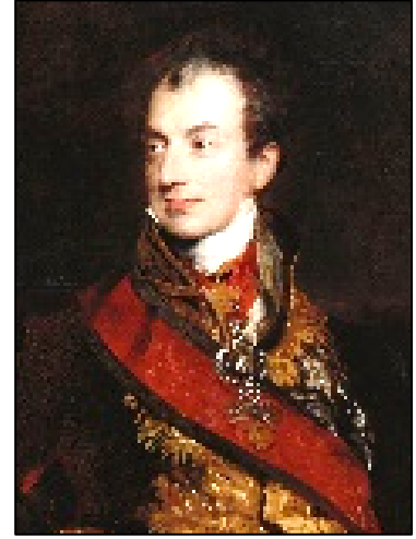
3. Metternich at the time of the Congress of Vienna in 1815 Portrait by Thomas Lawrence (aged 42)