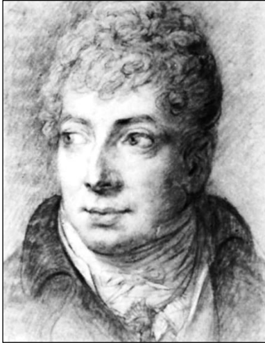
1. Metternich in c. 1803 Drawing by Anton Graff (aged 30)