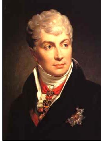
2. Metternich when appointed Austrian Foreign Minister in 1809 (aged 36)