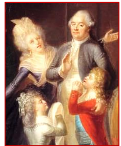
6. Louis bidding farewell to his children before his execution, January 1793 (aged 38)

© History Department, Curriculum Centre Annex, 2024 for Year 9 History (Option)