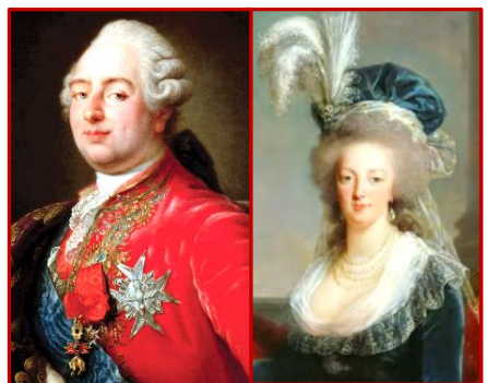
4. Louis and Antoinette on the eve of the French Revolution in 1787 (aged 33 and 32 respectively)