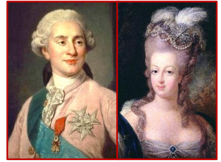
3. Louis and Marie Antoinette on their accession to the French throne in 1774 (aged 19 and 18 respectively)