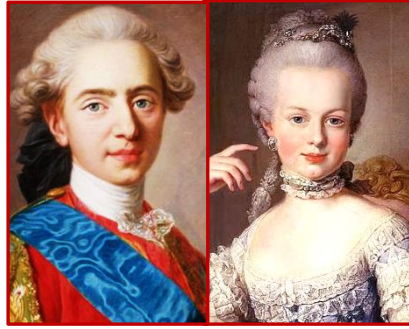
2. Louis and Marie Antoinette at the time of their marriage in 1770 (aged 16 and 15 respectively)