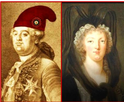
5. Louis with the red cap of the Revolution. Marie Antoinette wearing black after the execution of her husband.